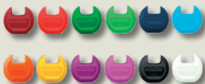
12 different key clip colors help in organization

Kaba matrix lock cylinders are upward compatible to the mechatronic Kaba evolvo system. Replacing the key clip with an electronic chip makes the key an electronic access control medium that aside from its mechanical keying can also be used for time and data recording, cash free vending and as an identification medium in electronic access control systems.