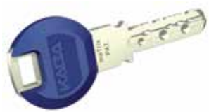
Kaba matrix „SmartKey“

The dealer code of Kaba matrix keys are manufactured in a CNC controlled slideway milling method guaranteeing highest precision. They are characterized by a high level of security, minimum wear and are highly reliable.