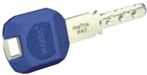
The Kaba matrix „LargeKey“ is ideal for long rosettes and multiple point locks