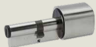
Kaba matrix can also be integrated into mechatronic master key systems