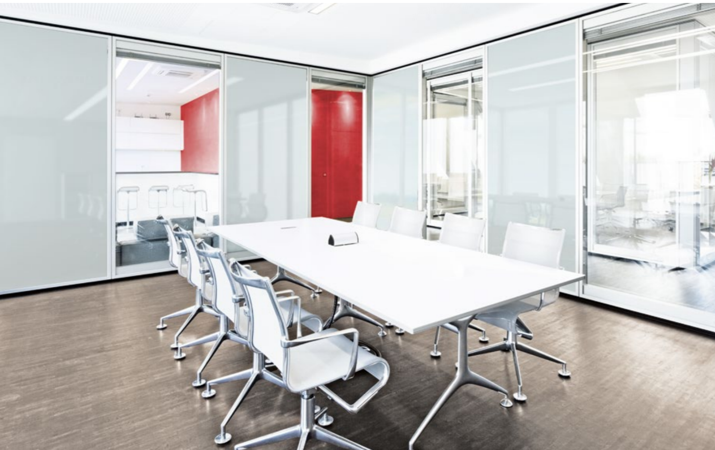
Magic ON. Transparent.

Even greater flexibility: Individual elements within the glass partition can be equipped with Magic Glass panels and separately operated for a partial effect.