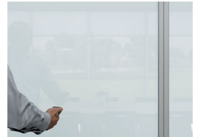
Magic OFF. Opaque

Focus undisturbed: As soon as the electrical supply to the Magic Glass is switched off, the milky glass coloration conceals the room from external gaze.